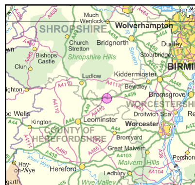
Ordnance Survey © Crown copyright [2007] All rights reserved. Licence number LIG0718