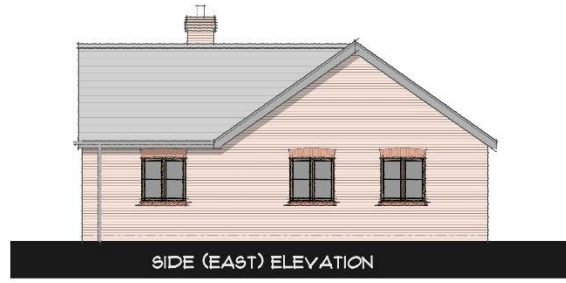
SIDE (EAST) ELEVATION