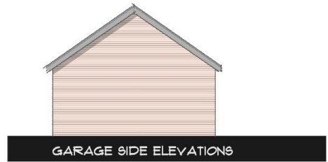
GARAGE SIDE ELEVATIONS