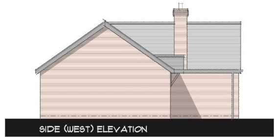
SIDE (WEST) ELEVATION